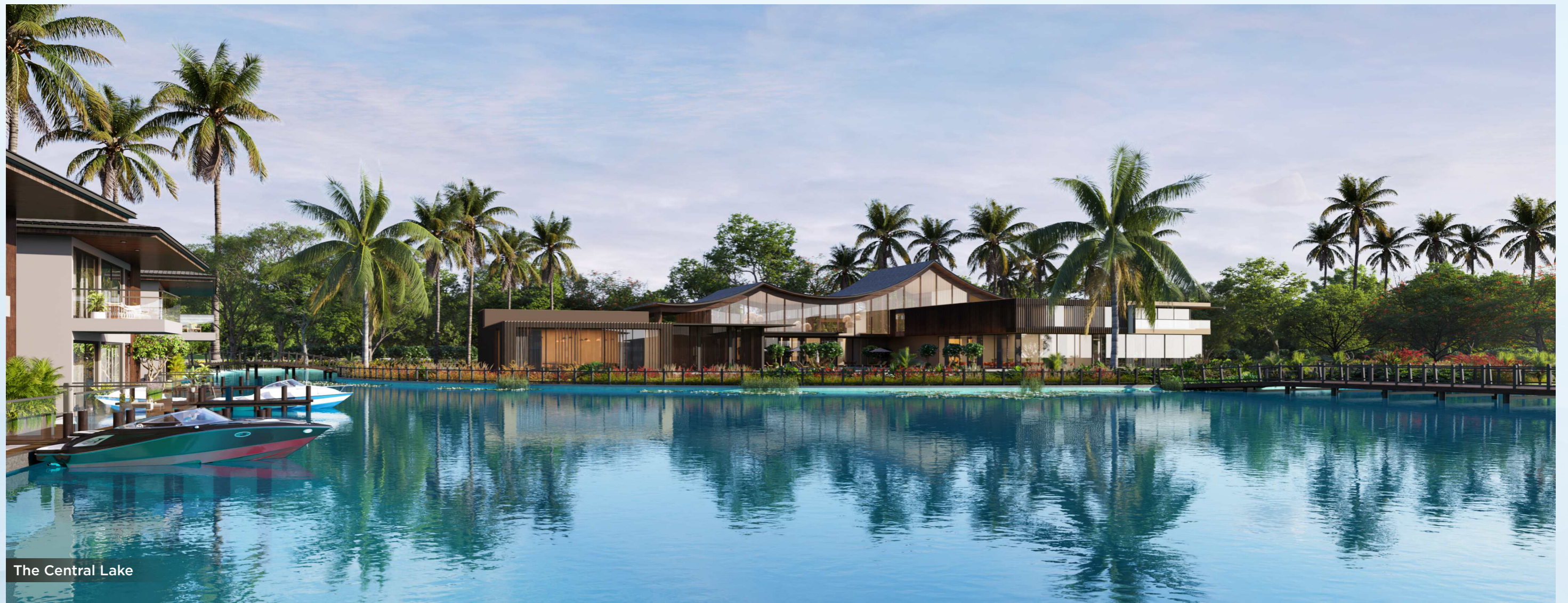
The Central Lake

At the core of this extraordinary estate lies a breathtaking 30-acre central lake and surrounding spaces serving as the serene heart of the community and setting the stage for an unparalleled living experience. The central lake is an iconic feature, artfully designed to evoke a sense of peace and harmony with its tranquil waters and lush surroundings. Nestled within this vast expanse of water are three distinct islands, each meticulously crafted to serve a unique purpose. Beyond these three islands, Arvind Aqua City offers an array of other luxurious amenities that blend seamlessly with the natural environment. Luxurious water villas line the shores, offering residents a unique living experience reminiscent of tropical paradises, while 11 temples provide spaces for spiritual reflection and community gatherings.